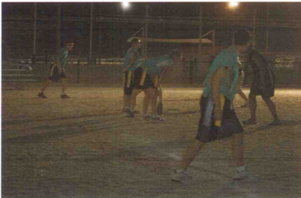
The dedicated “AVCRITTERS” of TF AVCRAD (in green) get set to run an offensive play during the first flag football game of the season.

The Soldiers of Task Force AVCRAD work extremely hard maintaining aircraft, providing logistical support, and generally contributing to the overall war effort. The work days are long and demanding. Free time can be limited and scarce. When the opportunity for free time does present itself, TF AVCRAD Soldiers have participated in several MWR functions. We have a respectable softball team, a flag football team, a newly formed basketball team, and an ongoing chess tournament.